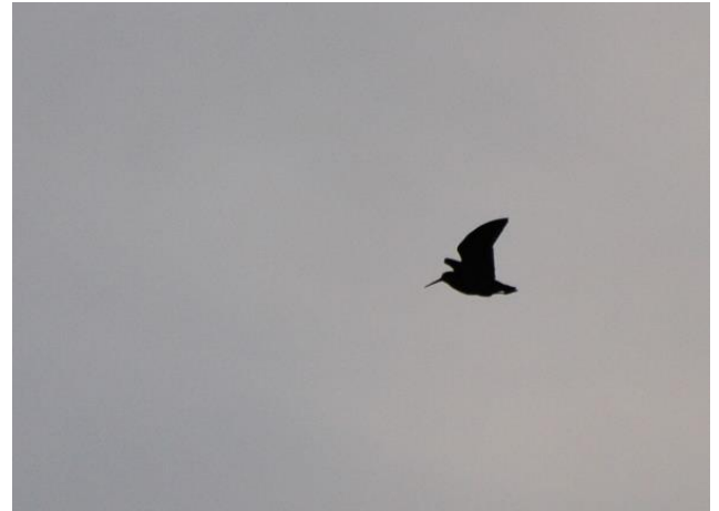
Rodriguez Woodcock: Neil Calbrade/BTO

The main focus will be to maximise coverage of the random selection of survey squares (Priority 1 & 2), to achieve a balanced sample of the four woodland area classes, which will provide the most accurate population estimate. Basically, the count period lasts 75 minutes. Counts should commence 15 minutes before sunset and finish 60 minutes after sunset, giving total survey duration of 75 minutes. During the 75-minute survey period all observations of Woodcock (in flight), both by sight and sound, will be recorded to the nearest minute and logged. Some basic information on Habitat and Deer presence will also be collected between mid-May and mid-June.