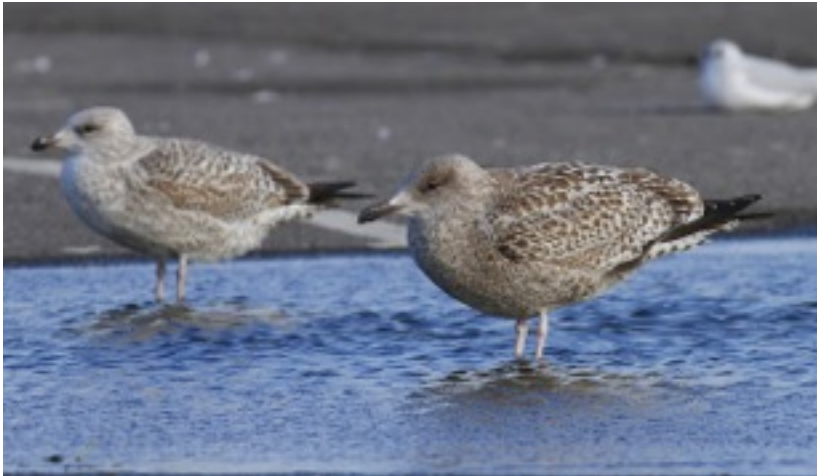
Scandinavian Herring Gull (right) with Herring Gull ( L. a. argentatus ) - Radipole Lake

Scandinavian Herring Gull ( L. a. argentatus ) 1 st winter around Radipole in December & January with an adult at Longham Lakes on 10 th January.